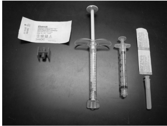
Figure 1: Left to right: Female-to-female luer lock connector, RADIESSE ® syringe, 3.0cc mixing syringe, sterile 27 gauge, 0.5” needle